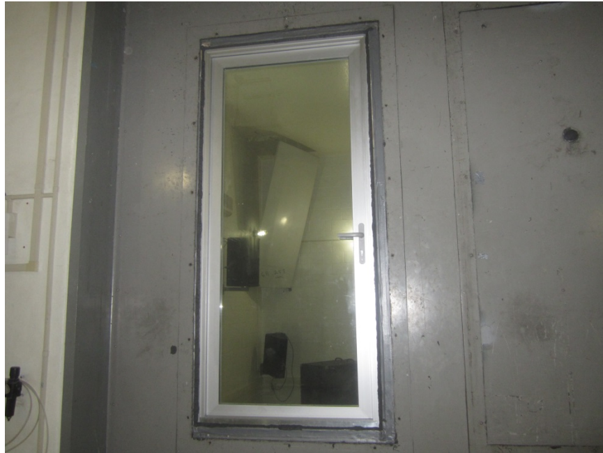
Receive Room View of Installed Specimen