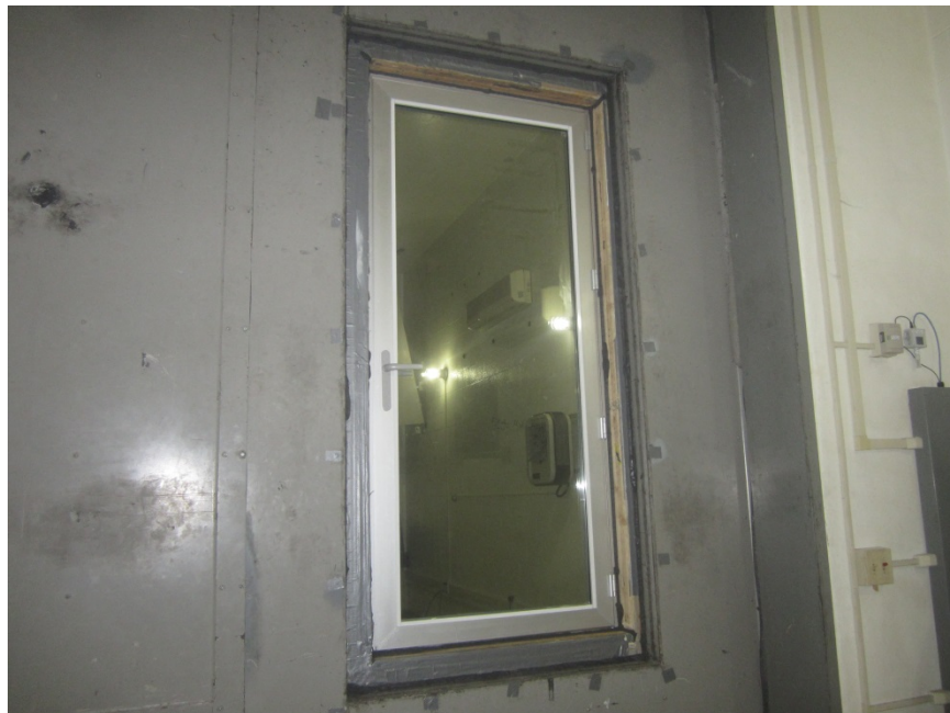
Source Room View of Installed Specimen